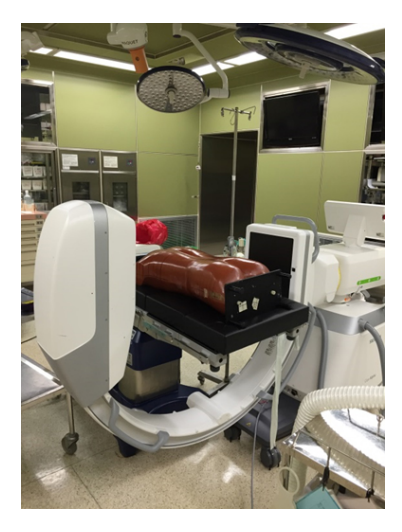
Fig. 1. The X-ray machine settings.

are measured in the same operating room. The phantom is lying on stomach side on operating table with lumbar vertebrae exposed. The position of phantom is fixed despite the change of exposure areas. The position where orthopedist most often stand is shown in Fig. 1. Suppose orthopedist wears 0.5 mmPb lead aprons and lead thyroid shied, and stands as close as possible to the patient. The mobile X-ray machine adopted is Cios Alpha (Siemens AG, Healthcare Sector, Erlangen, Germany). The X-ray is horizontally projected to achieve lateral image of lumbar vertebrae. Orthopedist stands by patient foot side. The X-ray is projected from left to right. The cathode side of the X-ray tube points to ceiling and the anode side of X-ray tube points to the ground. The center of the X-ray projector is 109 cm above the ground. Image plate is 30*30 cm. Anode target angle is 10 degree. Focal length is 0.3 and the original filter is 3 mmAl/0.1 mm Cu. Detector pulse is 40 nGy. The fluoroscopy is under automatic dose rate control (ADR) and automatic exposure control (AEC). The system automatically adjusts the kV/mA and kV/mAs value. The X-ray protects continuously for 10 seconds. And the scattered radiation doses in TH, TF, DH and DF are measured.