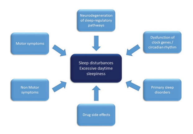
Fig. 1. Overview on factors contributing to sleep disruption in Parkinson's disease. Factors contributing to the pathophysiology of sleep disturbances and excessive daytime sleepiness in Parkinson's disease comprise of disintegration of sleep regulatory circuits and neurotransmitters as well as circadian rhythms by the neurodegenerative disease process. Nighttime sleep is disrupted by motor symptoms (such as akinesia, tremor), non-motor-symptoms such as autonomic or neuropsychiatric symptoms and drug side effects. Furthermore, primary sleep disorders such as restless legs syndrome and sleep disordered breathing contribute to nighttime and daytime impairment.

restless legs syndrome (RLS), and disturbances of circadian rhythm as the most prevalent sleep disturbances in PD with high inter individual and nightly variability [11–14]. Sleep disturbances compromise nighttime sleep quality as well as daytime activities and quality of life (QoL) of patients and caregivers [15-20] and may affect motor [21] as well as cognitive function [22, 23], mood [18, 24], and driving ability adversely [25, 26]. Although the pathophysiology of sleep disturbances in PD is complex involving multiple factors such as nighttime motor complications and adverse effects of PD treatment regimens, disintegration of sleep-regulatory pathways due to neurodegenerative processes affecting sleep regulatory circuits and neurotransmitters seem to play a key role particularly in the early phases of PD (Fig. 1) [27, 28]. The influence of neurodegenerative processes independent of motor complications and medication effects in PD is further validated by the occurrence of sleep disorders, especially EDS and RBD, in the prodromal phase of PD. In agreement with the current understanding of the pathophysiology and progression of PD, mainly alterations of sleep regulatory structures within the brainstem consistent with Braak stages 1 and 2 including the raphe nuclei and the locus coeruleus, seem to be responsible for these sleep disturbances [29]. However, recent findings in other neurodegenerative diseases,