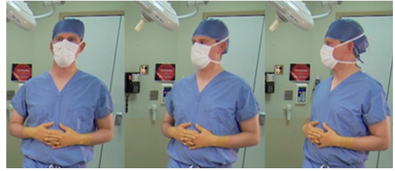
Fig. 4. Turn your head toward the right looking over your shoulder, feeling the lengthening in the back of your neck.

This activity engages spinal rotation beginning at C1 and progressing inferiorly to approximately T2. During this top-down activity, down modulation of muscle sympathetic activity occurs at each vertebral segment as muscles are gently lengthened. The lengthening of the neck muscles provides relief from the prolonged static contractions required to sustain an optimal head position for the surgical tasks. The rotation causes muscle relaxation on one side of the neck providing relief of facet joint compression. The gentle rotation by turning the head from side to side promotes normal sliding and gliding of the facet joints for articular surface nutrition and provides refreshing of the ECM fluids. Muscle relaxation reduces compression loads on the discs. The rotation