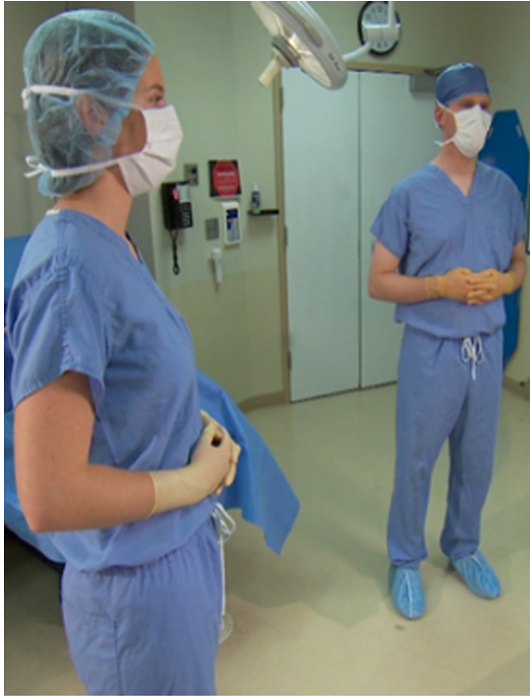
Fig. 2. Activity 1 Stand tall (base position for microbreak activities).

of a NMS trained physical therapist. Solutions were identified using clinical interventions which address specific tissue needs and mitigate their causing the problem. These were identified based on evidence from contemporary clinical literature. The physical therapist then integrated multiple interventions into activities which combined the solutions in a sequence that can build on the benefits of the prior intervention. The leveraging of the benefits from one solution to enhance a subsequent intervention makes the sequence of the activities critical in order to optimize benefits while minimizing the time required for the activities. The integrated activities achieve the overarching goals of: 1) posture correction (PC); 2) normalization of tissue tension and soft tissue mobility/gliding (NT); and 3) relaxation/stress reduction (SR), as indicated in Table 2.