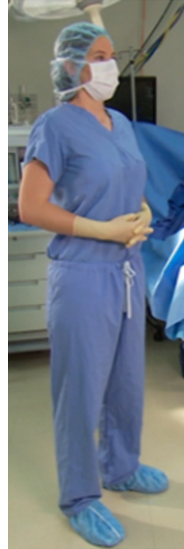
Fig. 3. Deep Breath (Take a deep breath in, filling out your ribs. Keep your chest high as you breathe out).

Performing the first two activities (Figs. 2 and 3) establishes a foundation of posture correction and decreased muscle sympathetic activity, thus initiating relaxation and establishing a relaxed stance from which to move into other activities which focus more narrowly on the greatest areas of concern as defined