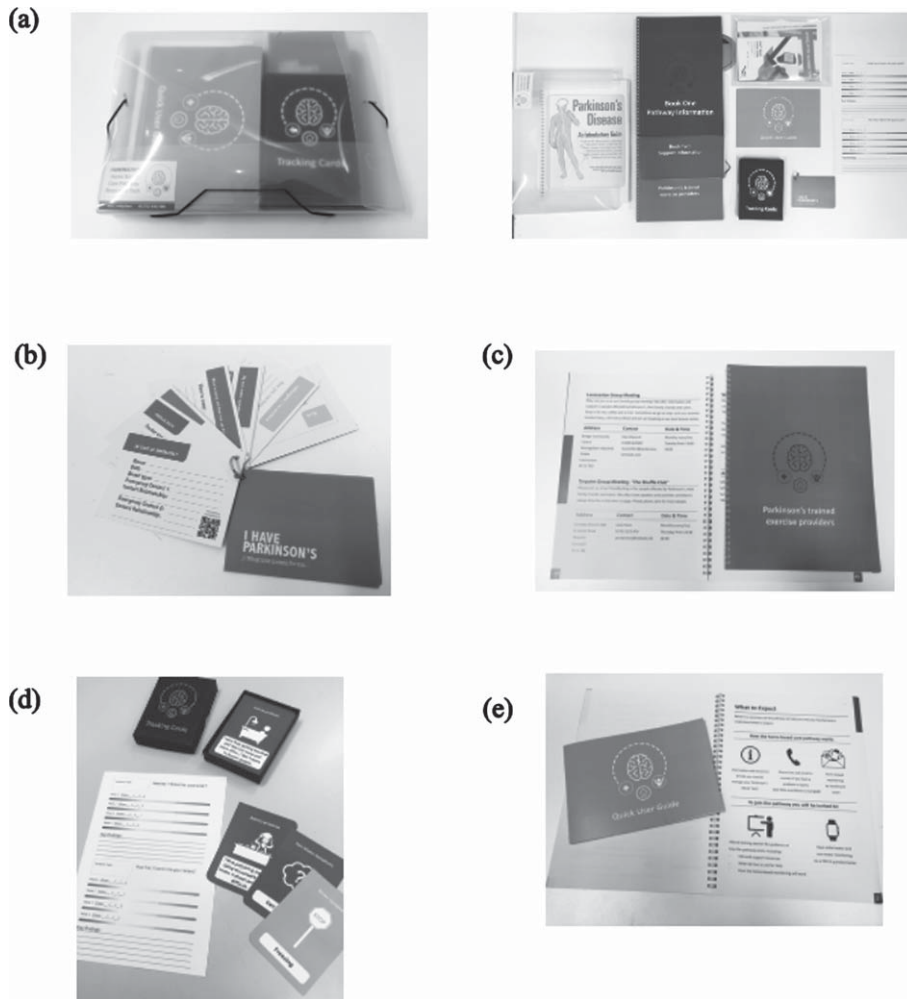
Fig. 3. Home-Based Care resource pack. (a) The Home-Based Care Pathway pack; (b) Parkinson's patient passport; (c) Service and local information; (d) A card deck to support self-reflection; (e) A self-management support and general information package. The pack included information about Parkinson's service provision and support available for PwP and care partner; details of a single point of contact; information about Parkinson's disease; information and guidance for symptom monitoring and management; lifestyle advice; a Parkinson's patient passport to capture key aspects of Parkinson's important to the PwP.

(MDS-UPDRS II)), the Non Motor Symptoms Questionnaire (NMSQ), the Parkinson's Disease Sleep Scale 2 (PDSS2), and the Hospital Anxiety and Depression Scale (HADS). A bespoke questionnaire on medications and the main concerns of PwP and their care partners was also created (see Questionnaire 1, Supplementary Material).