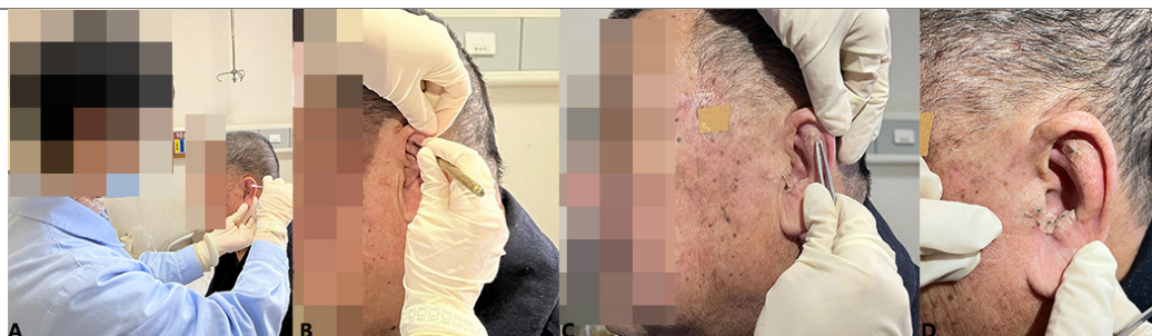
Fig. 1. Auricular bean-pressing process. (A) Disinfection; (B) Selected auricular acupoints; (C) Fixed Cowherb seeds; (D) Finished.

For auricular disinfection, a cotton swab was pressed onto the acupoints (Fig. 1A). Four auricular acupoints on the same side as the affected knee were selected; these corresponded to the knee and to adrenal, subcortical, and endocrinal [10] functions (Fig. 1B). Cowherb seeds (Tai Cheng Company) were fixed and pressed in an alternative press–release pattern, moving from light to heavy pressure (Fig. 1C). Each acupoint was pressed 20 times, for 5 s each time, to strengthen the stimulation. The pressing strength was sufficient for turning the auricle red, warm, or sore while remaining tolerable. The acupoints on both ears were pressed alternately for 3 min/acupoint, 3 times/d. The cowherb seeds were changed every 3 d, and the course of treatment was 4 weeks [11] (Fig. 1D). The cowherb seeds were fixed to the side where the KOA was observed and were pressed daily in the morning, at noon, and in the evening, with each time lasting approximately 3 min. Pressing was stopped when the patient experienced soreness, numbness, or fever. Patients received the guidance of professional traditional Chinese medicine (TCM) clinical staff to maintain their compliance and ensure accurate acupoint pressure performance.