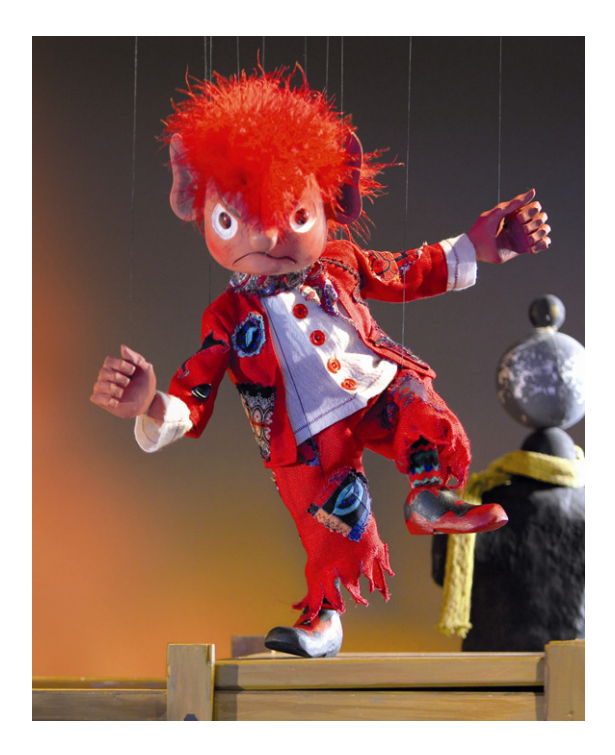
Figure 1. Protagonist "Zornibold", representing the basic emotion "anger" of the interactive story 'Puppet in the Box Story' (the puppets were manufactured by the Augsburger Puppenkiste).

Related materials support the proper identification of emotions (e.g., pictures of the puppets' faces, a CD with recordings of their voices). Papilio-3to6 cooperates with the puppet theatre "Augsburger Puppenkiste" and several materials have been developed, including for example a puppet play with wooden puppets, songs with emotion content, and picture books, a radio play, and a DVD (puppet play; see www.papilio.de, for further information).