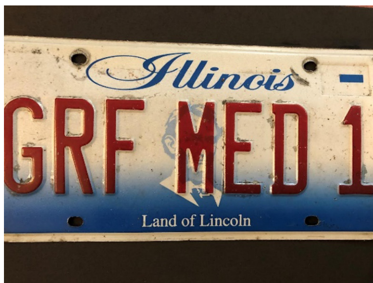
Photo 2. A license plate retired along with Grateful Med after many outreach miles in Illinois and Iowa.

transmitted suggested MeSH terms helpful for editing a search. This feature gave trainers an opening to discuss searching the database with controlled vocabulary. Loansome Doc could then be used to procure the articles from the Grateful Med project library, often free of charge, or from other cooperating libraries.