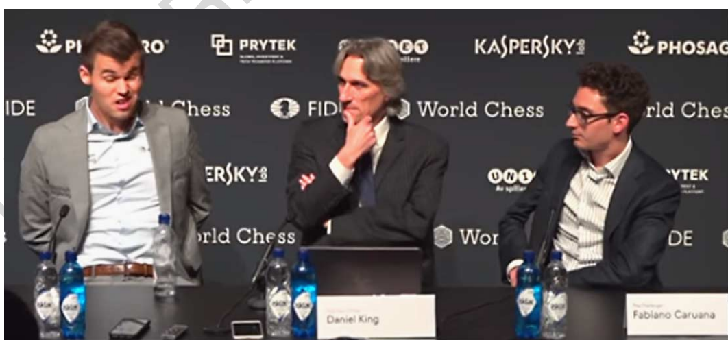
Fig. 1. Magnus Carlsen, Daniel King and Fabiano Caruana hear that a computer called 'mate' for Black.

By dint of remarkable, defensive play, Magnus escaped with a draw and was relieved to do so. He admitted that he now believed in fortresses with 'It's a good thing they exist, right!' Certainly, Fabiano believed Magnus had constructed a fortress and for that reason, he had not been examining every position for 'accidental opportunities'.