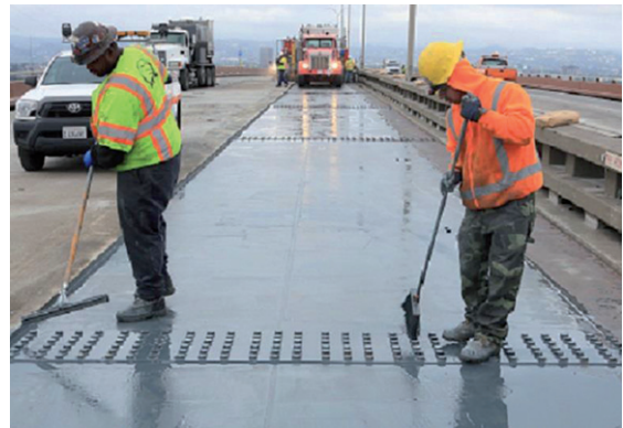
Fig. 3. Splice plate receiving prime coat.

Since the deck sections were field bolted with splice plates, a nominal riding surface thickness of 2” was needed to cover the bolt heads. Paving was done over a 3 week period. The EAC riding surface was paved in two lifts. After painting the deck with a zinc-rich paint as an added protection against corrosion, an epoxy-asphalt bond coat was applied to adhere the riding surface to the steel. The bond consisted of a mixture of epoxy resin, asphalt and resin hardeners. The EAC was paved using conventional methods and techniques used for placing a typical asphalt concrete roadway. This EAC riding surface material far exceeded expectations. It was over 30 years before any signs of decline were observed or any major maintenance was required, and was in service for almost 48 years before it was replaced in May 2015.