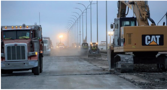
Fig. 5. Removal process of EAC.

with a 2' wide strip polyester concrete. These longitudinal strips were simply placed within the old EAC riding surface. The 2' wide strips then served as a screed to control the profile grade when the full scale weekend work began. The edge of deck profile grade was controlled using the barrier rail while the center line profile grade was controlled by the center rail's concrete base. There are two longitudinal splice plates between the edges of deck and the center barrier rail. These splice plates run the entire length of the orthotropic bridge. The transverse splice plates were removed during the weekend work but well ahead of the heavy equipment removing the EAC.