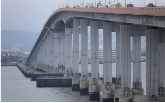
Fig. 1. San Mateo/Hayward Bridge orthotropic high rise section (Courtesy of John Huseby, Caltrans).

“high rise” portion of the 7 mile long bridge [1] (Fig. 1).