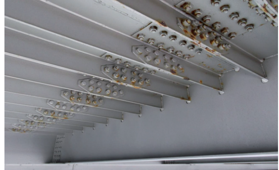
Fig. 2. Photo from underneath the bridge showing the deck plate welded to the ribs and one of the floor beams (Courtesy of Ric Maggenti, Caltrans).

The original riding surface placed in 1967 was Epoxy Asphalt Concrete (EAC), which is a thermoplastic asphalt modified with a thermosetting epoxy consisting of a mixture of epoxy resin, asphalt and resin hardeners. The 1967 choice of using EAC resulted from a thorough evaluation of over 40 materials that included laboratory tests and actual field trials on smaller orthotropic bridges [2].