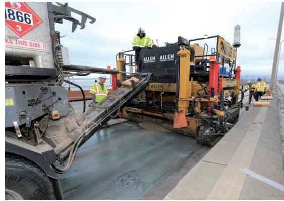
Fig. 6. A continuous volumetric mixing/batching truck discharging polyester concrete into the paver.

For preparation of the deck to receive the polymer concrete, the deck was abrasively cleaned by self-propelled shot blasters followed by hand-held "sand" blasting until it met contract compliance with SSPC-SP 6/NACE. A liberal coat of methacrylate resin containing zinc powder was then applied to the surface. The process of removal, preparation and paving continued on day and night through the weekend with