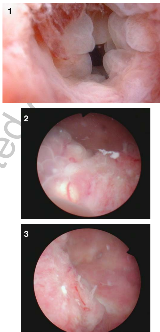
Fig. 1–3. Sessile tumor in the bladder and extending to the bladder neck and into the prostatic urethra.

The next decision was whether to prescribe neoadjuvant chemotherapy. After considering his general medical status and the immunosuppression we elected to proceed with a radical cystoprostatectomy and ileal conduit urinary diversion. The pathology indicated that the tumor extended to the