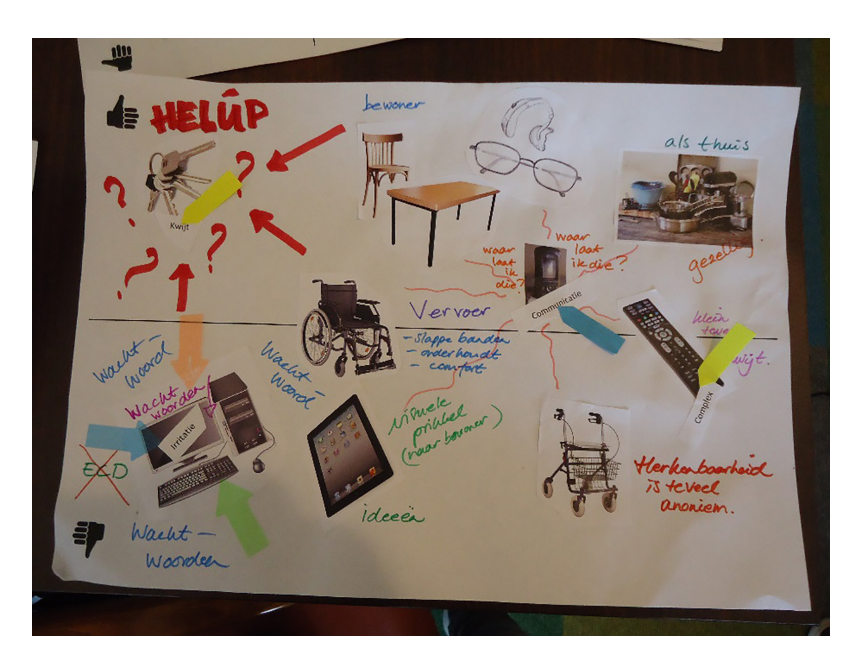
Fig. 1. One of the collages.