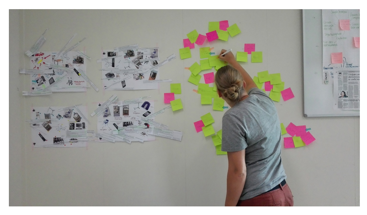
Fig. 2. First analysis of the findings on the wall.

and the researchers (examples of a collage: Fig. 1). The problems and opportunities related to the use of assets that came forward in the presentations were documented on the wall.