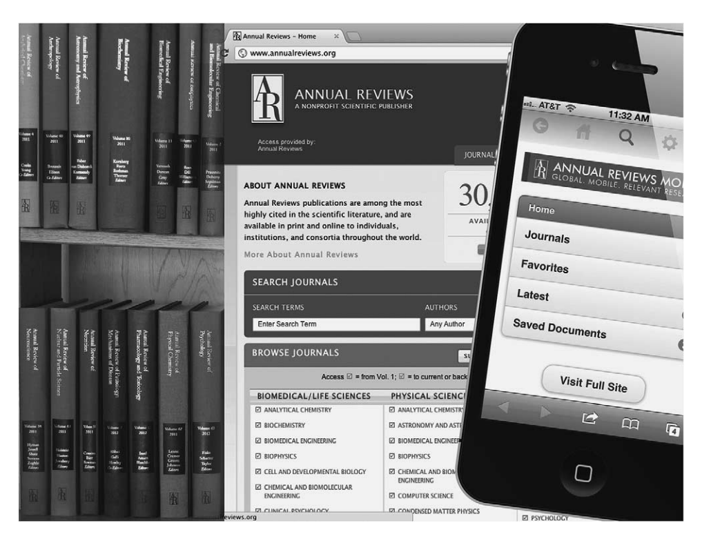
Fig. 1. Annual Reviews has evolved through the information ages.

citations – although around 150 per article, this is a considerable reduction on the complete literature in a field. We're valued as a time-saver, and it is in the context of that core strength that we continue to evolve our products to meet changing user needs. We are conscious that sociological and technological shifts affect our readership, and that the next-generation's academics are Google-centric multi-taskers. We have undertaken research over the past several years to explore how the needs of this group differ from their predecessors and to understand what is important to them. Around 100 early-career researchers, typically between the ages of 25 and 35, have participated in our focus groups and reinforced to us that the critical review is still necessary and valuable; they do not want us to change the essential nature of what we do, but they do want new and convenient formats and content delivery.