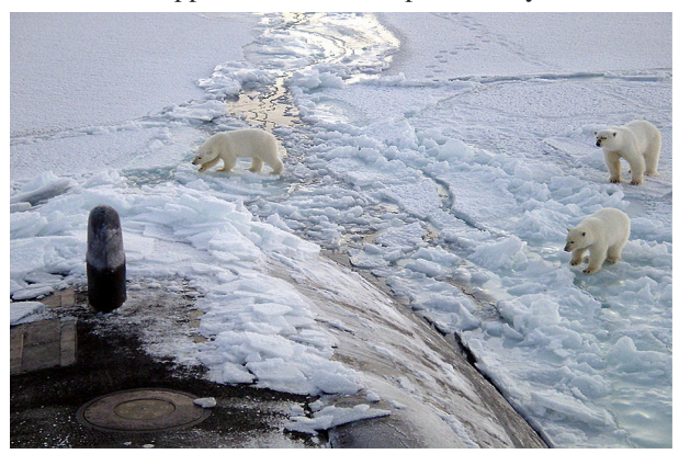
Polar bears investigate the submarine USS Honolulu, 280 miles (450 km) from the North Pole

Reaching into the toolkit of soft diplomacy, an extensive section on promoting scientific cooperation contends the importance of research to US interests in the Arctic. Playing a lead role in regional research, the US will continue to support collaboration particularly to advance